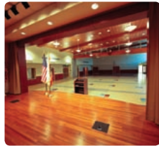
Main Event Room