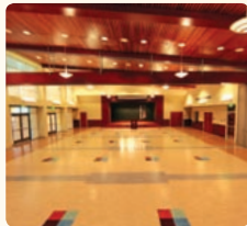
Salón para Eventos