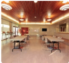
Salón de Reunión

Para mayor información, como disponibilidad y costo, contacte al Departamento de Servicios Comunitarios al (310) 973-3270. O visite el sitio web de la ciudad, www.lawndalecity.org , y vaya a 'Government, Departments, Community Services, Facilities Rental' y haga clic en 'Facility Rental' y 'Deposit Fee Schedule' para obtener todos los detalles de los salones y los precios.